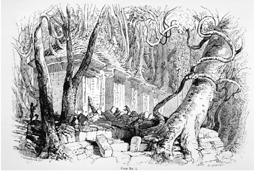
Figure 1.3 Catherwood drawing of the ruins at Palenque, Chiapas (from Stephens 1841)

sometimes have little or nothing to do with the ancient Maya and, in some cases, have been quite condescending toward their modern oppressed descendants (Montejo 1991; Castañeda 1996; Hervik 1999).