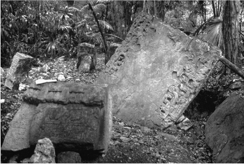
Figure 1.1 Fallen monuments at the Petén site of El Peru

of this society continues to challenge the imaginations of the public and the efforts of scientists.