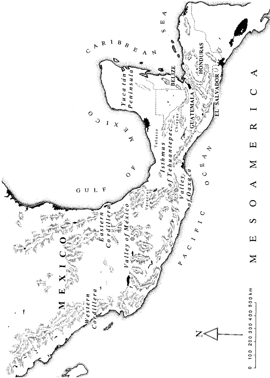
Figure 2.1 Mesoamerica, showing major geographical features (drawn by Luis F. Luin)