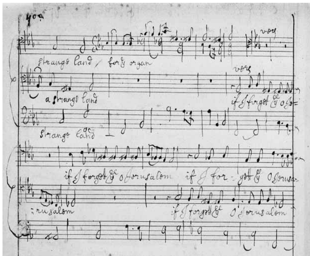
Illus. 1.1 Pelham Humfrey, By the waters of Babylon , copied by Purcell. British Library Add. MS 30932, fol. 53v

income, because hardly any of his movements for string band were composed in the late 1670s; the principal document of his work at this period, the great autograph scorebook Cfm 88, suggests that his first major responsibility at court was the editing and composition of Anglican sacred music in the distinctly conservative style that provided the mainstay of the Chapel Royal repertory on weekdays and when the king did not attend the Chapel in person. 13 It is perhaps surprising that the youthful composer of My beloved spake was apparently steered away from the prestigious symphony anthem, but until Purcell's twenty-first birthday his superiors in the royal service seem to have subjected him to quite rigorous discipline, at first putting him to work revising and correcting earlier music and only in 1680 allowing him to