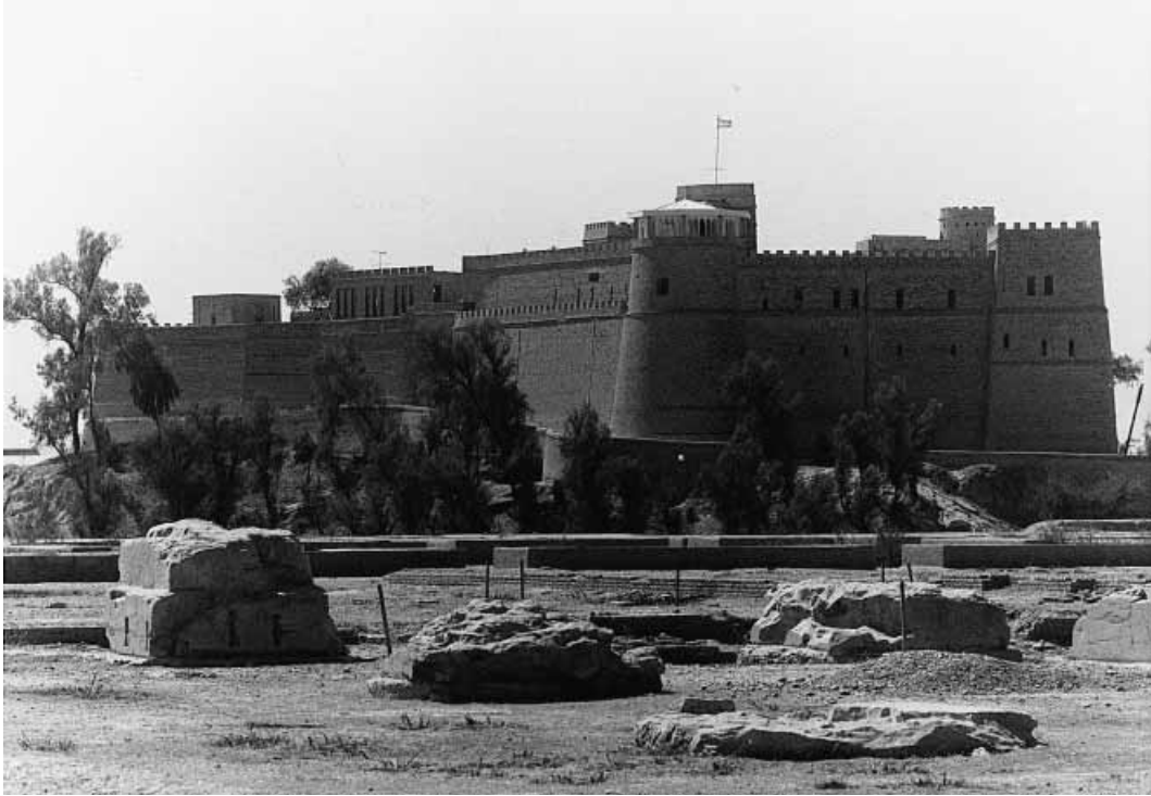
Plate 1.2 Château Susa, the fortified excavation house begun on the Acropole by Jacques de Morgan in 1898.

Artaxerxes II (404–359 BC) – identified by some with King Ahasuerus of the Book of Esther (other scholars believe Biblical Ahasuerus to have been Xerxes, e.g. Heltzer 1994) – mentioning the palace of Darius which had burned in the lifetime of Artaxerxes I as well as the new palace built by Artaxerxes II, there was no longer any doubt about the identity of modern Shush and Biblical Shushan (Curtis 1993: 22, 31–2), and indeed this was the basis for the resumption of investigations at the site by the French expeditions (Dieulafoy 1888; 1893; see also Harper, Aruz and Tallon 1992: 20–4) of the late 19th century (Pl. 1.2).