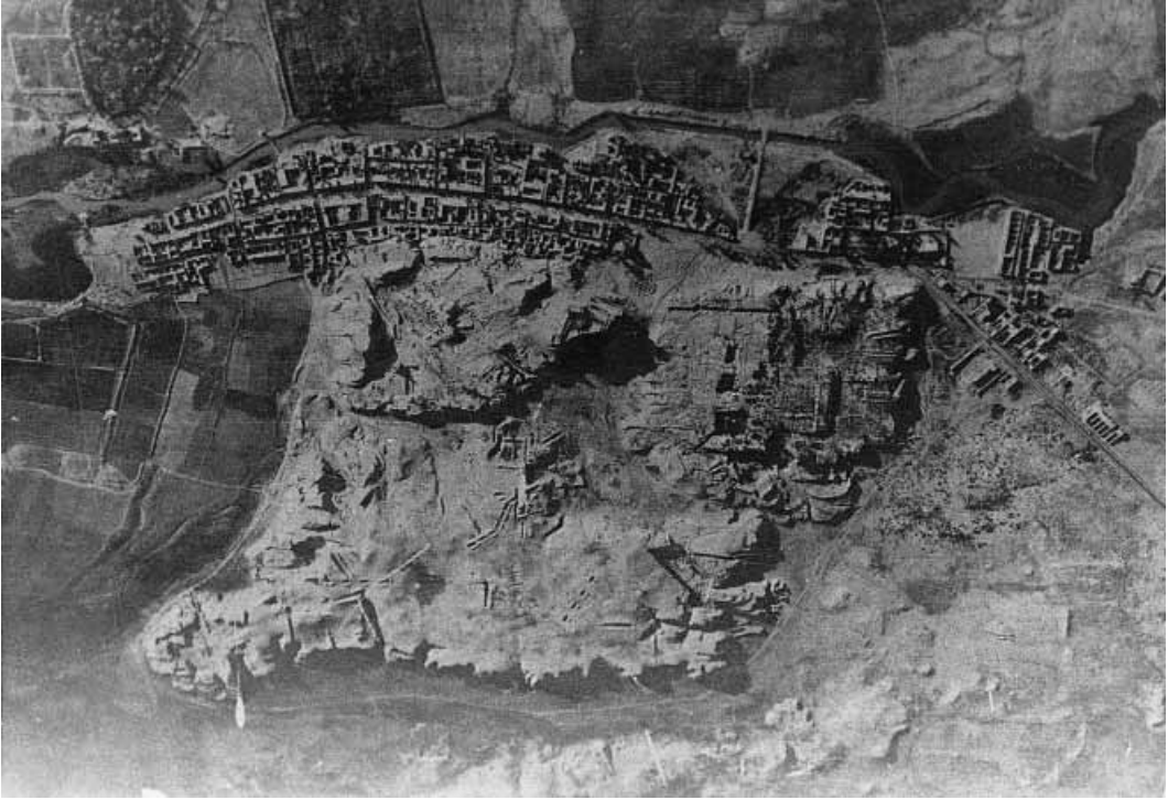
Plate 1.1 Aerial view of Susa (from an original in the Susa Museum).

1969: 54). Although the nineteenth century witnessed the documentation of numerous trilingual Achaemenid inscriptions (Pallis 1954: 52–3), as well as many attempts at their decipherment, the Elamite versions of these texts were not satisfactorily deciphered until 1890 when F.H. Weissbach published his PhD dissertation on them (later appearing in revised form as Weissbach 1911).